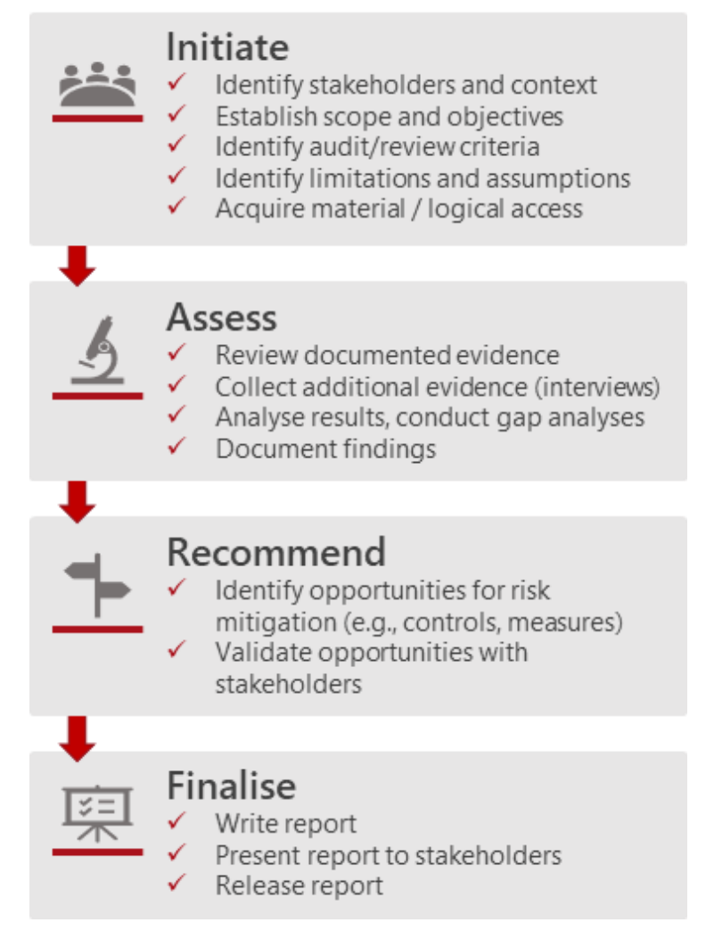
Figure 1 - Process

8. The examination was based on SCRT's information systems audit methodology. The process specifies four-phases, which are depicted in the figure below: