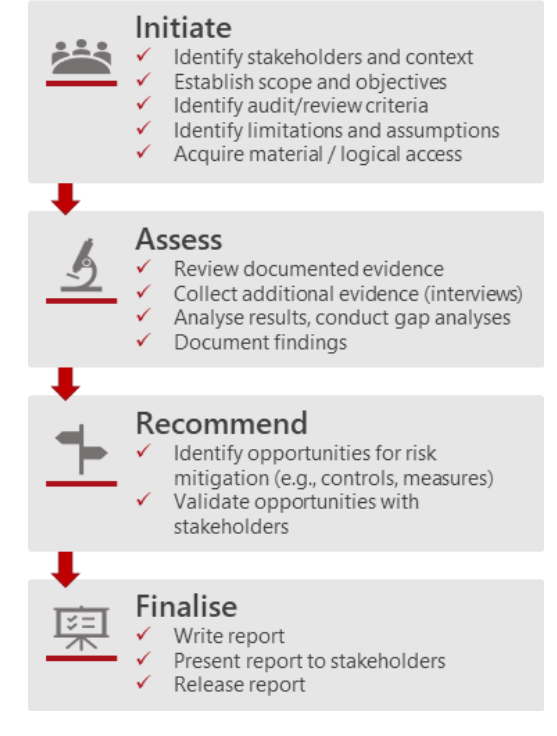
Figure 1 - Process

7. The examination was based on SCRT's information systems audit methodology. The process specifies four-phases depicted in the figure below: