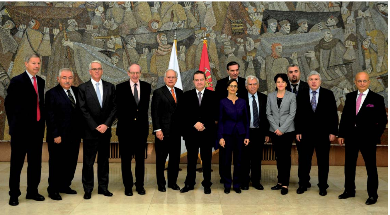
OSCE Chairperson-in-Office, Serbia's First Deputy Prime Minister and Minister of Foreign Affairs Ivica Dačić, with the members of the Panel of Eminent Persons in Belgrade, 2 October 2015.