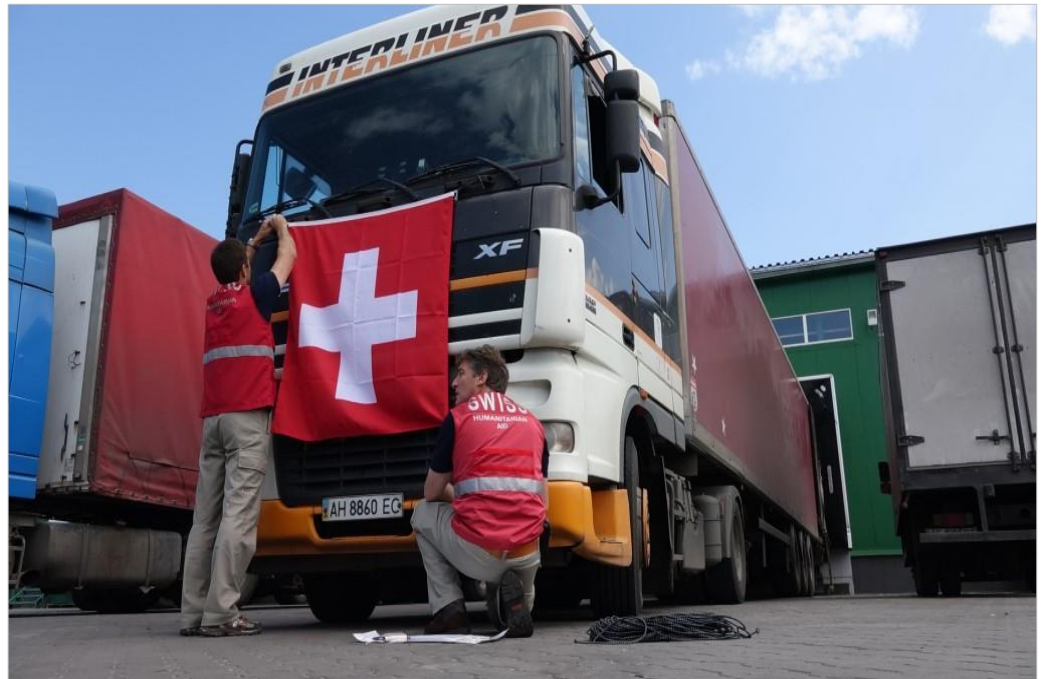
On 15 May 2015 the Swiss Humanitarian Aid (SHA) sent 15 trucks carrying 300 tons of chemicals for the treatment of water from Dnipropetrovsk to Donetsk.