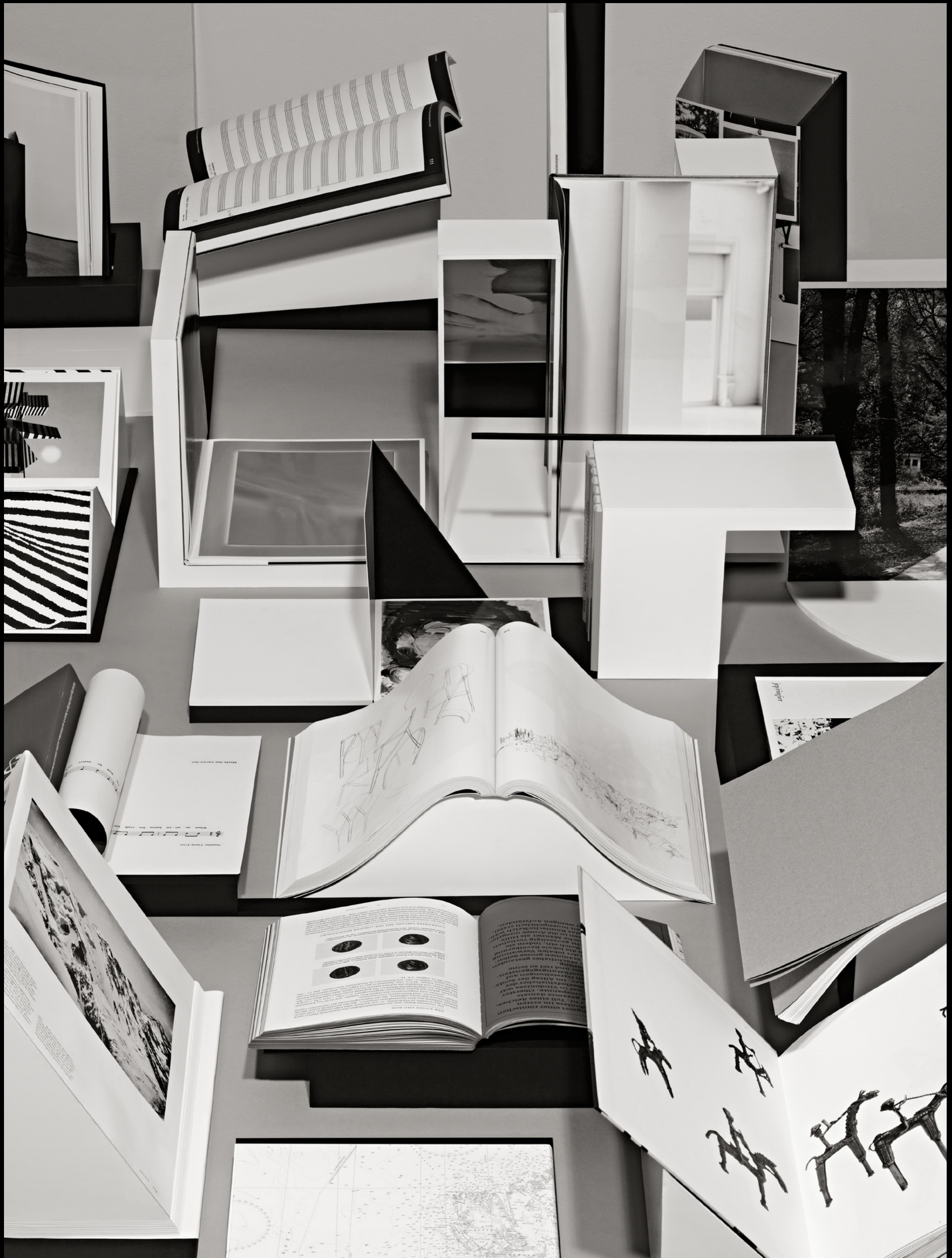
Die schönsten Schweizer Bücher Les plus beaux livres suisses I più bei libri svizzeri The Most Beautiful Swiss Books 2012