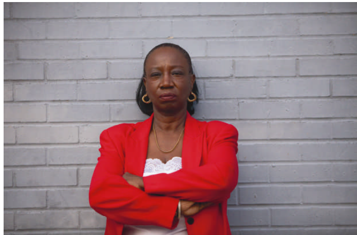
Filmstill: Copyright © SAGA Production

Production: SAGA Production Chemin de Montelly 46 CH – 1007 Lausanne Phone +41/21/311 95 70 Fax +41/21/311 95 72 info@sagaproduction.ch www.sagaproduction.ch www.clevelandcontrewallstreet.ch