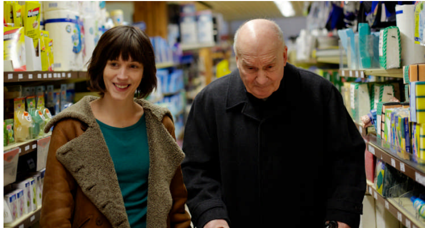
Filmstill: Copyright © Vega Film

Production: Vega Film Helenastrasse 3 CH – 8034 Zürich Phone +41/44/384 80 90 Fax +41/44/384 80 99 info@vegafilm.com www.vegafilm.com