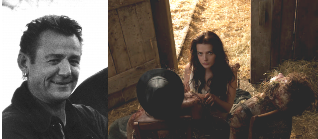
Picture: Copyright © Gerald Damovsky / Filmstill: Copyright © Kontraproduktion

«Gerald Damovsky's production design contributes essentially to the eerie, gloomy atmosphere, which turns «Sennentuntschi» into a powerful, abysmal and absolutely non-Swiss alpine thriller».