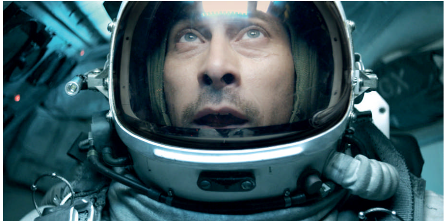
Filmstill: Copyright © Port-au-Prince

Production: Oliwood Productions Häldelistrasse 19 CH – 8712 Stäfa Phone +49/174/332 66 90 oliverrihs@hotmail.com